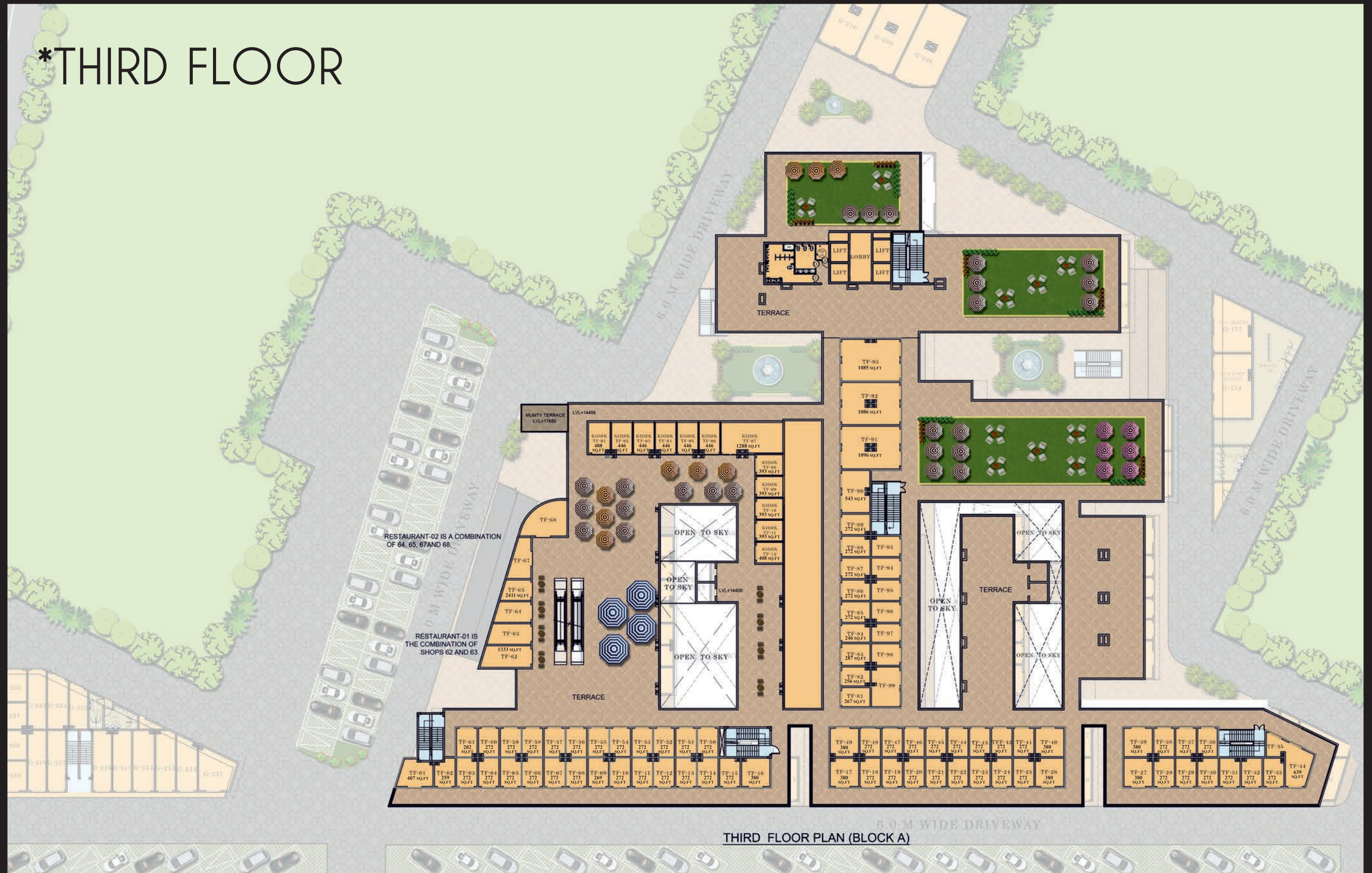
THIRD FLOOR PLAN (BLOCK A)